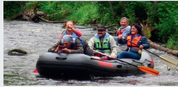
Boaters on River Brasla