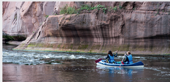
Canoeing at Kūku Cliffs