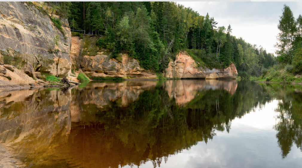
Ergļu (Ergēļu) Cliffs