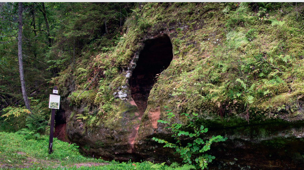
Ligava (Sarkanā) Cave